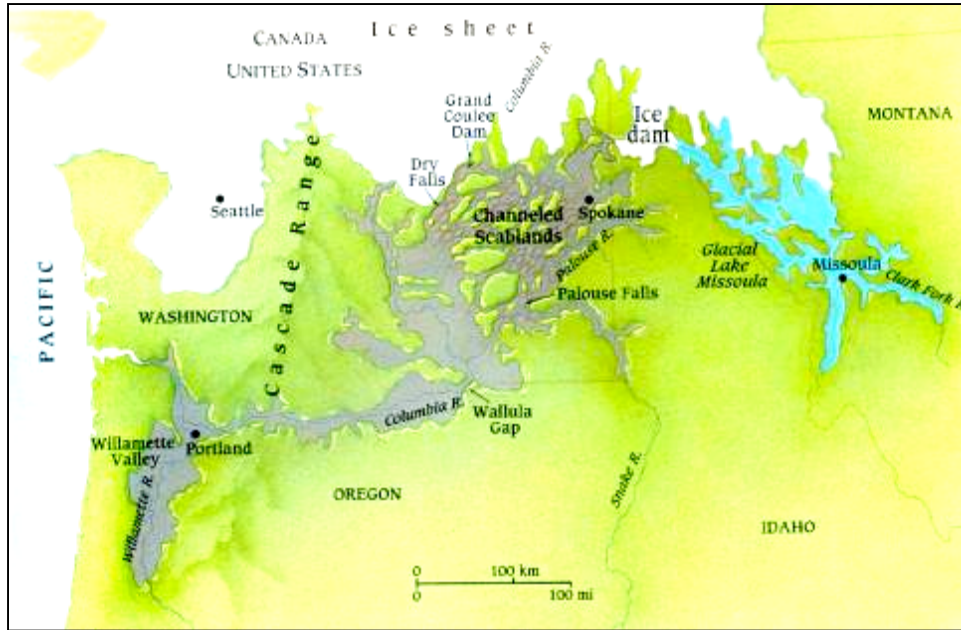
Figure 3. Map of the channeled scablands of eastern Washington, showing ice age glacial Lake Missoula, locations of the flood channels and present day Dry Falls. http://www.washington.edu/burkemuseum/geo_history_wa/Cascade%20Episode.htm