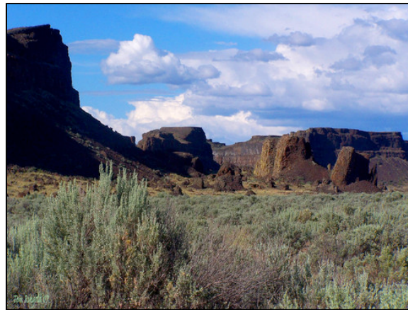
Figure 4. Typical big sagebrush steppe community in Sun Lakes State Park showing the basalt cliffs of Umatilla Rock on the left and Dry Falls in the background.