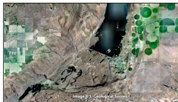
Figure 1. Sun Lakes State Park and surrounding area, showing fertile loess hills in agricultural use surrounding the channeled scabland topography of the Grand Coulee in the lower left, below the engineered Banks Lake (upper center).