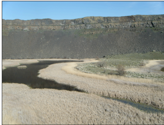
Figure 6. Red Alkali Lake, showing typical wetland zonal vegetation pattern, from open water in the center to upland sagebrush steppe in the strip on the right. Green Lake barely showing on the right. Note invasive Russian olive trees along perimeter. Talus slope in background. looking east.