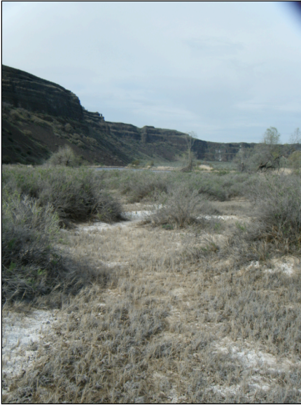
Figure 5. Alkali flat vegetation exemplifying the pattern of Sarcobatus scrub with patchy Dystichlis ground cover and white salt crusts covering the soil. just south of Dry Falls Lake looking northeast; Dry Falls and visitors center in background.