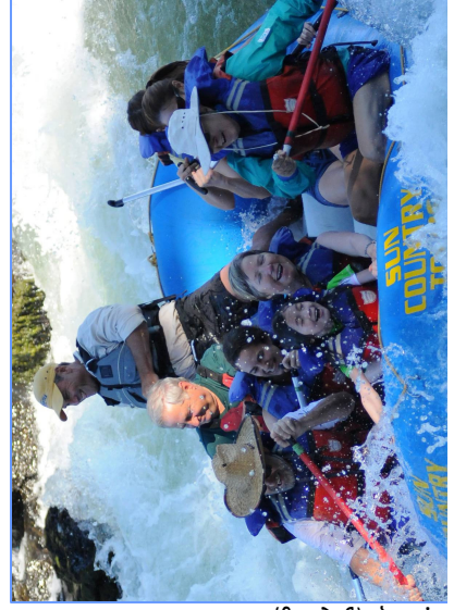
At right: last days of Summer, September on the Deschutes River near Bend.