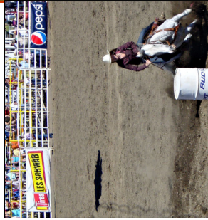
Sister's Rodeo – every June since 1940!