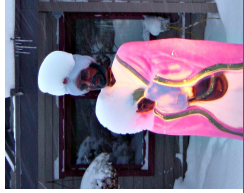
Below: April along Rte 26 east of the Cascades Crest.