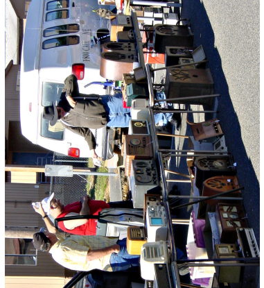
At left: August in Seattle, antique radio geeks exchange treasures.