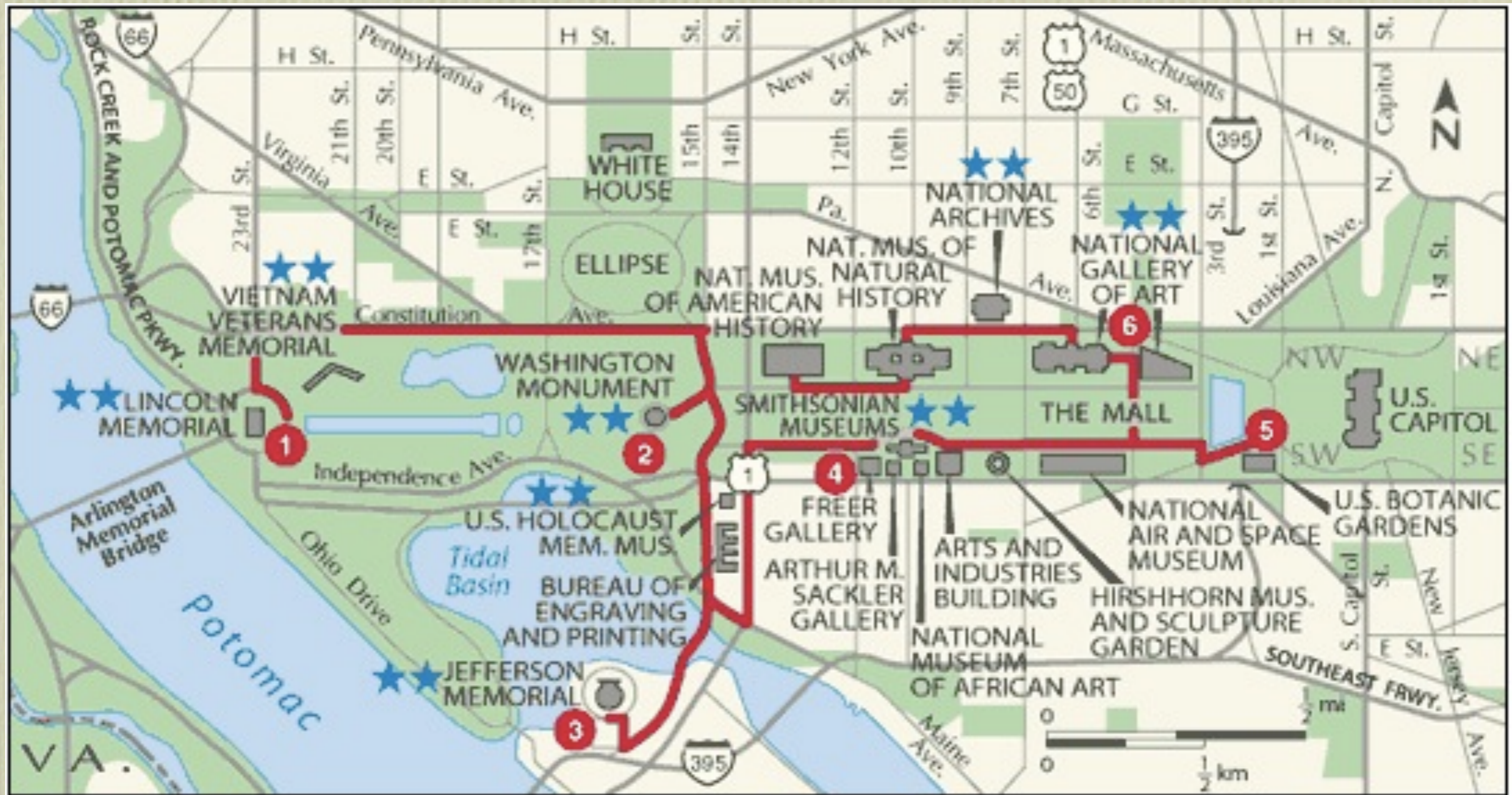
National Mall Walking Tour, Washington, D.C.